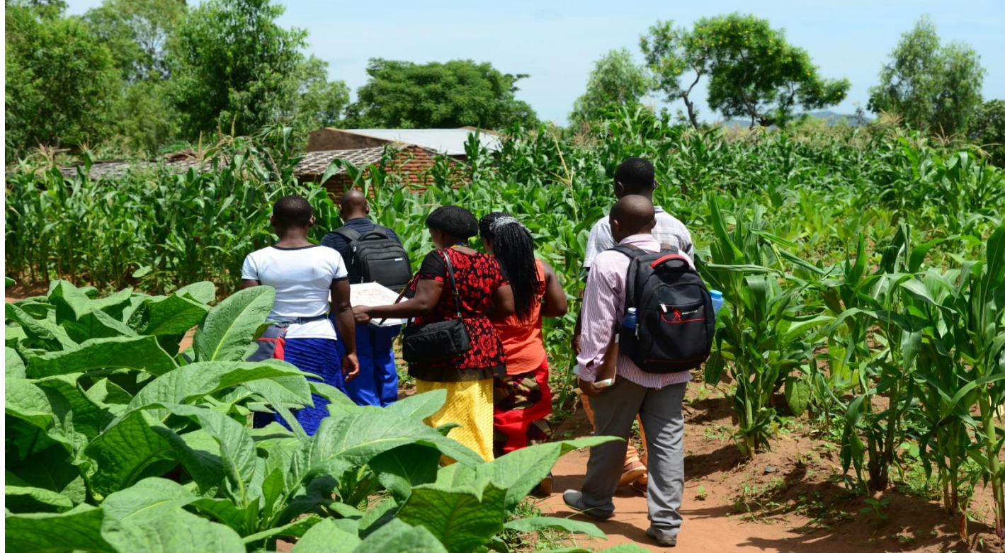
Adjudication and demarcation exercise in Phalombe