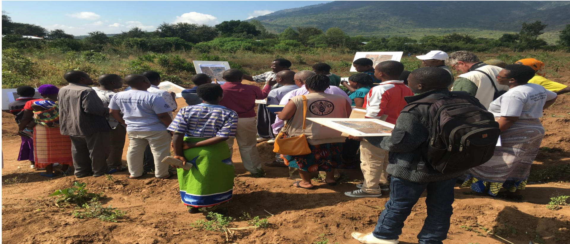
Training on the use of satellite imagery in the adjudication and demarcation of land parcels